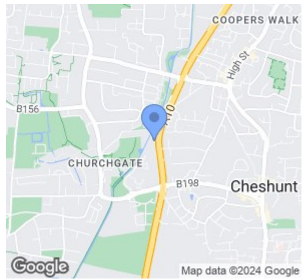
Illustration for identification purposes only, not in scale