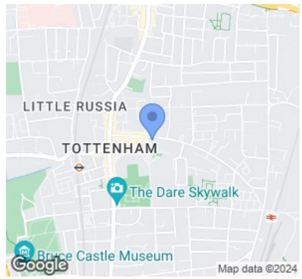
Illustration for identification purposes only, not in scale