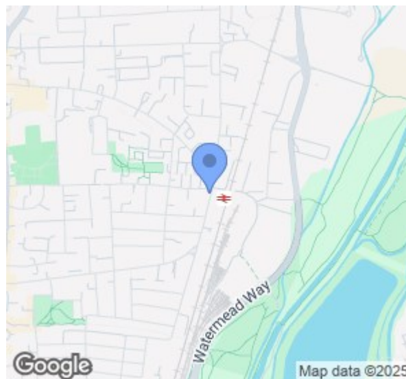
Illustration for identification purpose only, not in scale