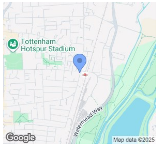
Illustration for identification purpose only, not in scale