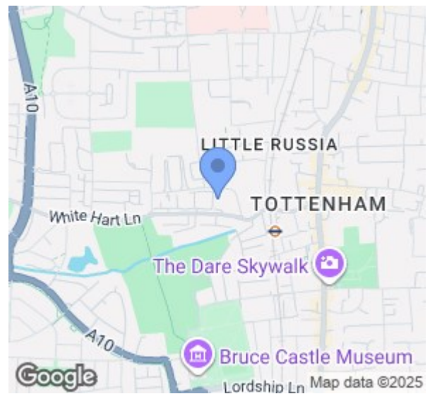
Illustration for identification purposes only, not in scale