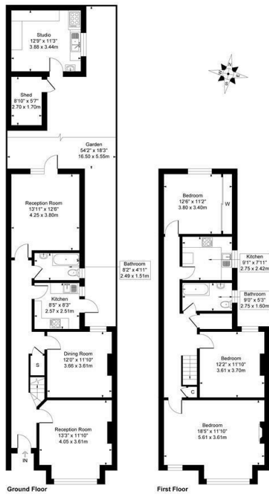
Illustration for identification purposes only, not in scale

Approximate Gross Internal Floor Area = 170.93 sq m / 1840 sq ft