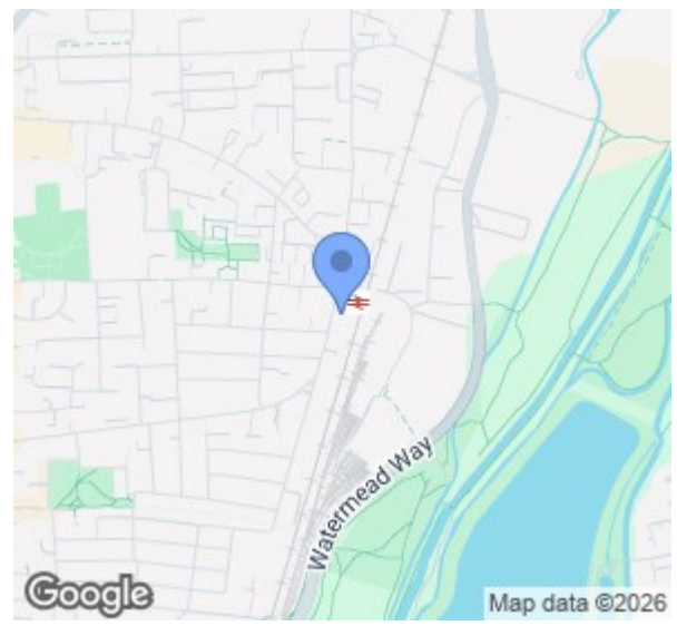
Illustration for identification purposes only, not in scale