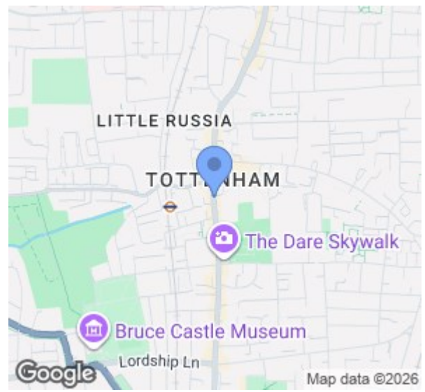
Illustration for identification purposes only, not in scale