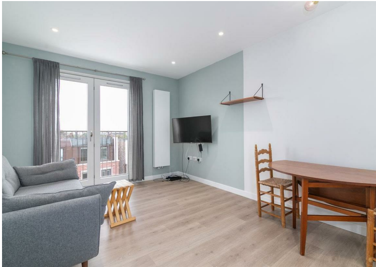
Illustration for identification purposes only, not in scale