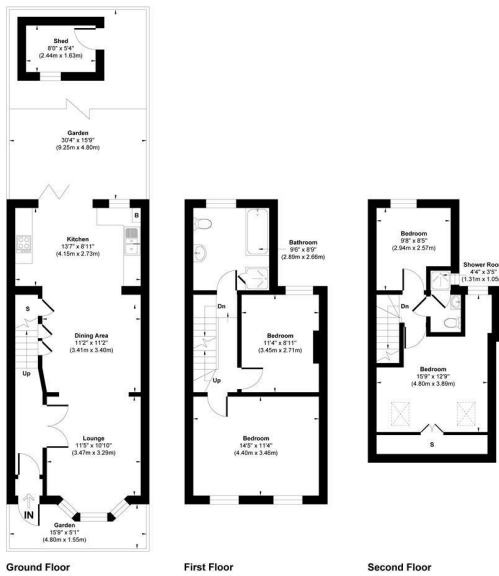
Illustration for identification purpose only, not to scale.

Approx. Gross Internal Floor Area 1258 sq. ft / 116.89 sq. m (Including Shed)